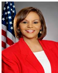
Robin Kelly Democratic Party Nominee For Illinois Treasurer Award Presenter